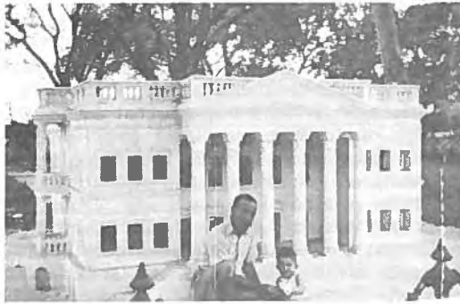
Above: Our President at the Hyderabad Residency Model in 1943. It was then in pristine condition. See story on p. 31