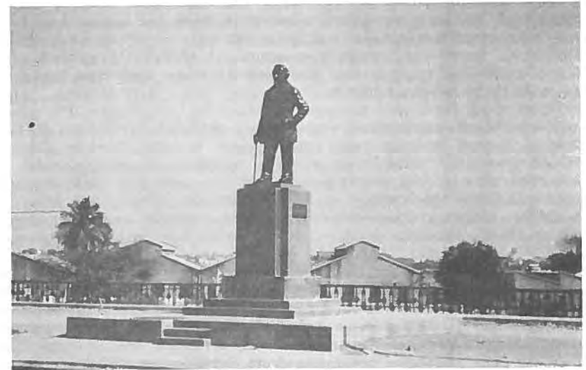
Above: The newly erected statue to Sir Arthur Cotton at Hyderabad. See p. 30